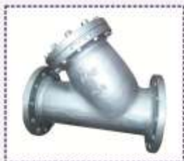
Y Type Strainer