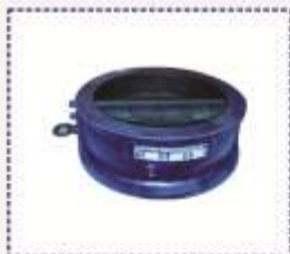
Dual Check Valve